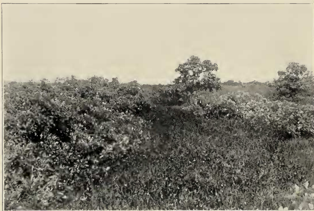
HEATH HEN ENVIRONMENT